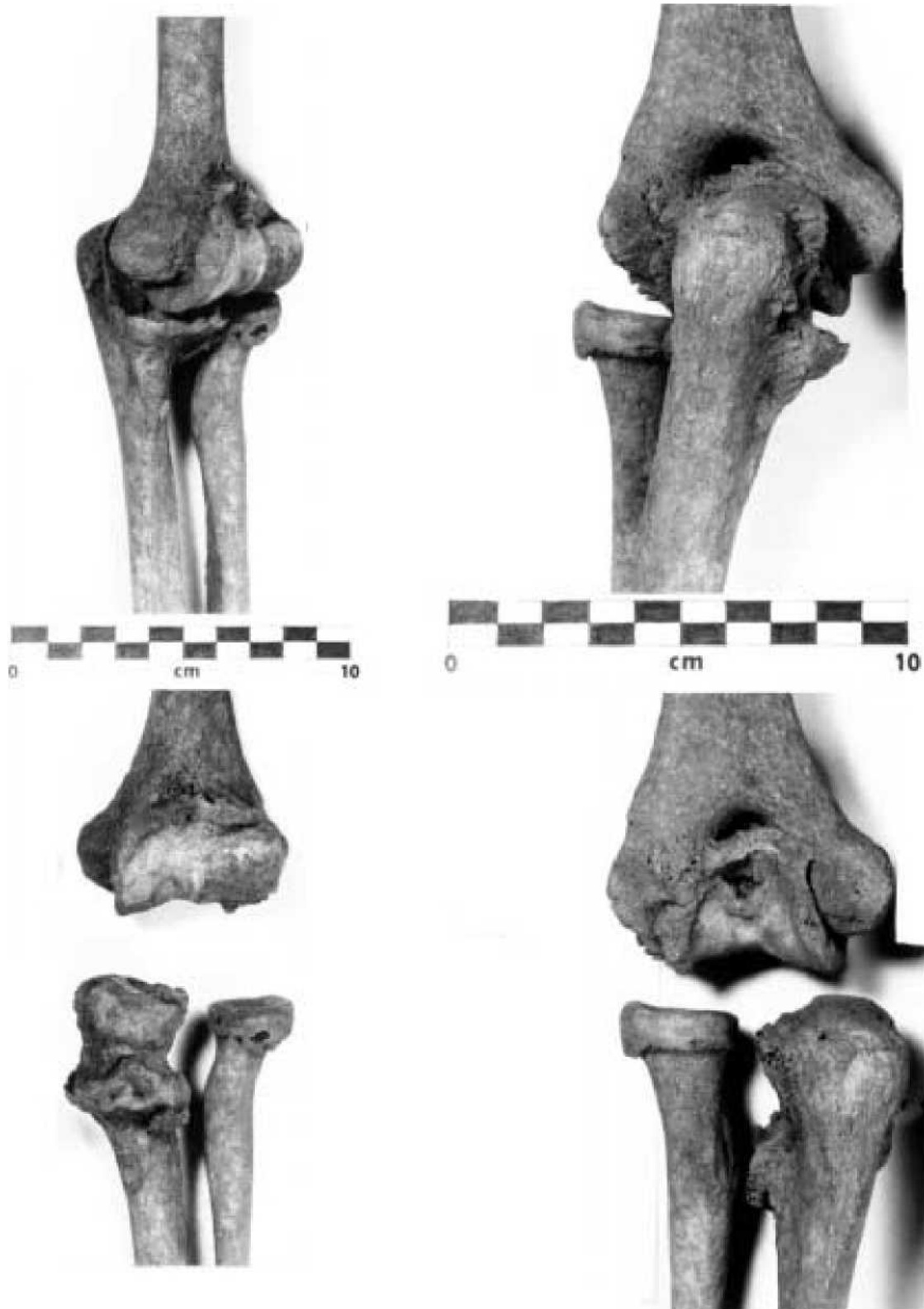
Fig. 18.5. Bones illustrating osteoarthritis of the elbow.