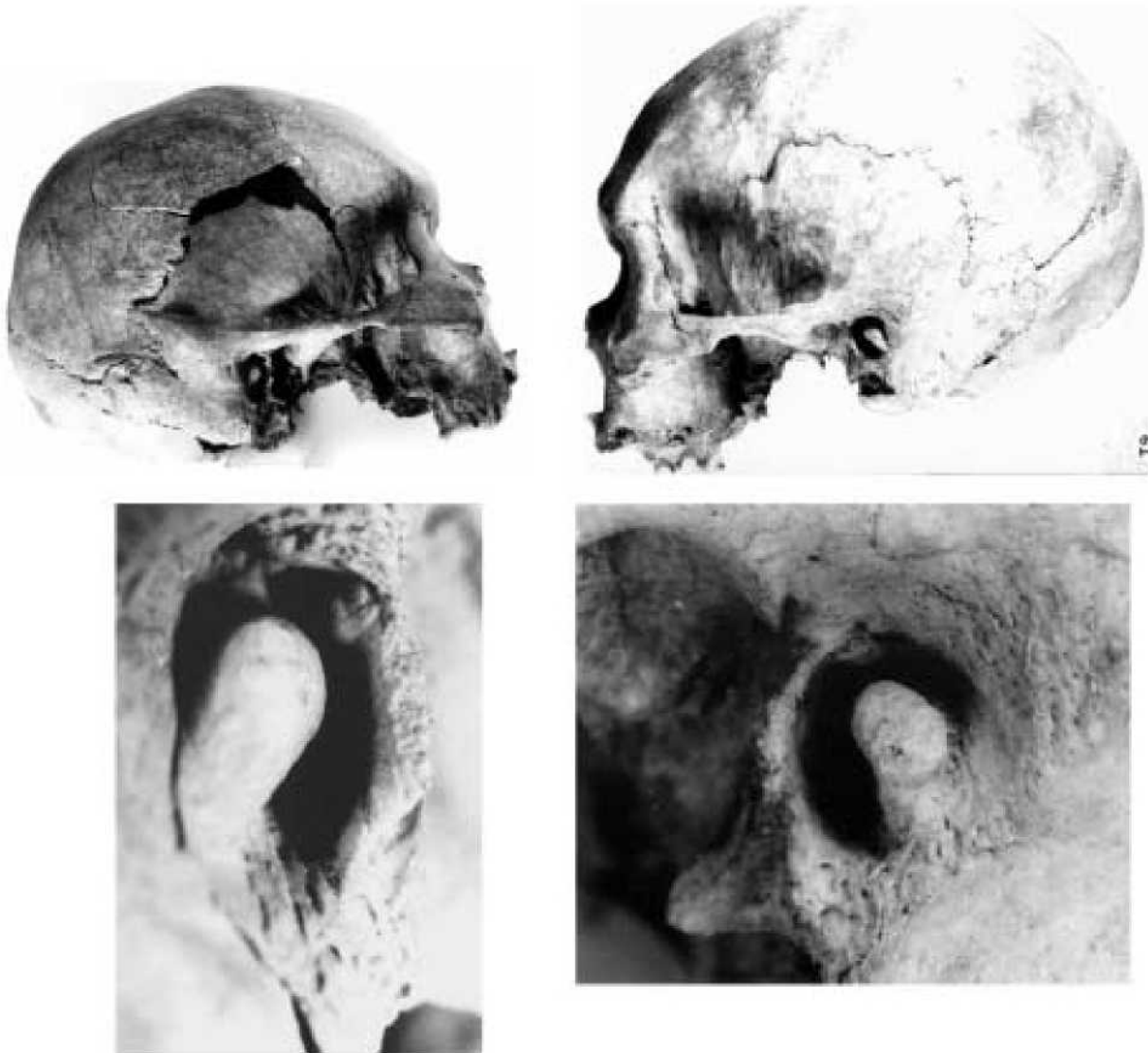
Fig. 18.3. Traumatic injuries and auditory exostoses on burials from Eel Point C (SCLI-43C).

cal sites where conditions are unfavorable for the preservation of bone, the incompletely calcified skeletons of infants and children disintegrate much more rapidly than those of adults. As a result, the remains of these immature individuals tend to be under-represented in skeletal collections (Walker and Snethkamp 1984:61; Walker and Johnson n.d.). Since the preservation of our skeletal sample is quite good, however, differential preservation of this kind has probably not greatly biased the collection.