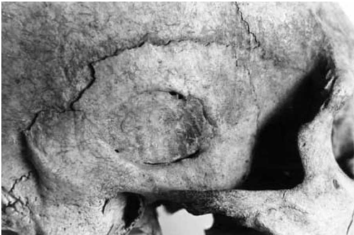
Fig. 18.4. Cranial injury, Burial 2 (depressed fracture of temporal bone).

The post-cranial fractures evident in the Eel Point and Nursery Site burials could have been sustained during warfare or some other kind of interpersonal violence. They could just as easily be from accidental falls