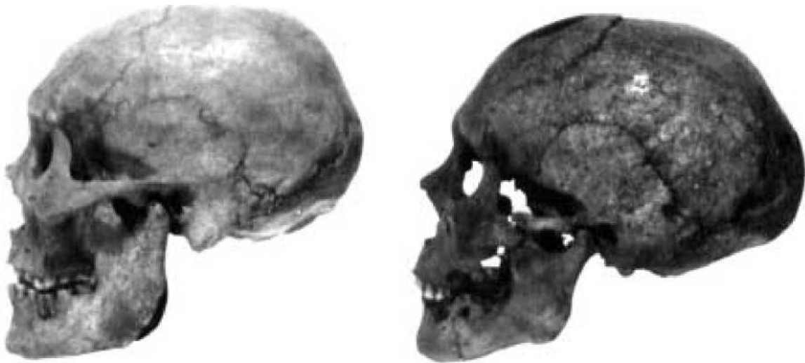
Fig. 18.1. Crania from Eel Point C (SCLI-43C) (left) and Nursery (SCLI-1215) (right) in profile.

Marked contrasts in cranial morphology between the Nursery and Eel Point skeletal collections indicate that two different groups of people lived on San Clemente Island during the prehistoric period (Figs. 18.1 and 18.2). The Eel Point crania are short from front to