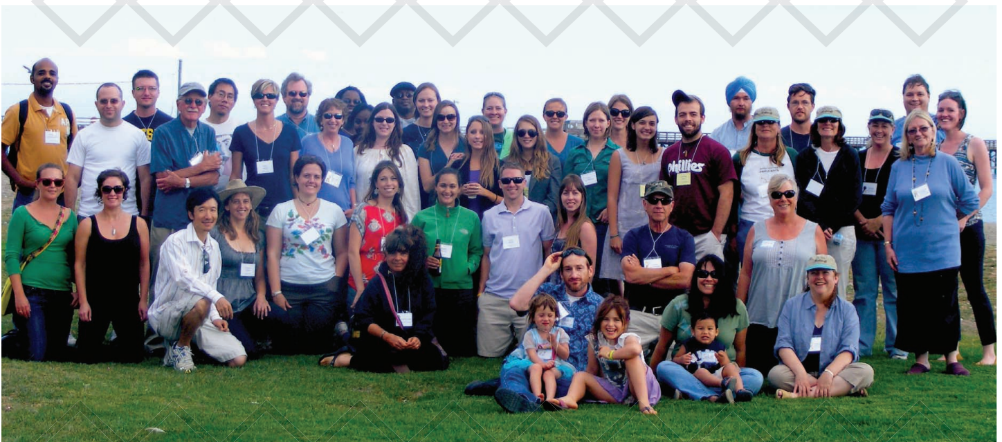
Anthropology Picnic Attendees

February 25-26, 2011, "Spaces of Relation," 9th Graduate Student Conference, Department of Modern Languages and Literature, University of Miami . Call for Papers. Deadline for submissions: November 29, 2010.