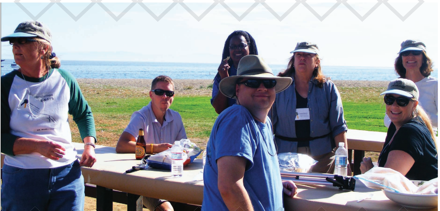
Anthropology Picnic 2010 - Staff

Jennings Randolph Program for International Peace dissertation fellowships . For students researching and writing dissertation on conflict and international peace and security issues. Information at jrprogram@usip.org . Deadline January 5, 2011.