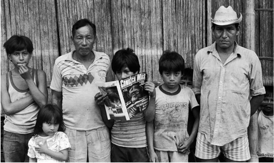
FIGURE 2. Ávila circa 1992.

Such an endeavor might seem detached from the more mundane worlds of ethnographic experience that serve as the foundations for anthropological argumentation and insight. And yet this project, and the book that attempts to do it justice, is rigorously empirical in the sense that the questions it addresses grow out of many different kinds of experiential encounters that emerged over the course of a long immersion in the field. As I've attempted to cultivate these questions I've come to see them as articulations of general problems that become amplified, and thus made visible, through my struggles to pay ethnographic attention to how people in Ávila relate to different kinds of beings.