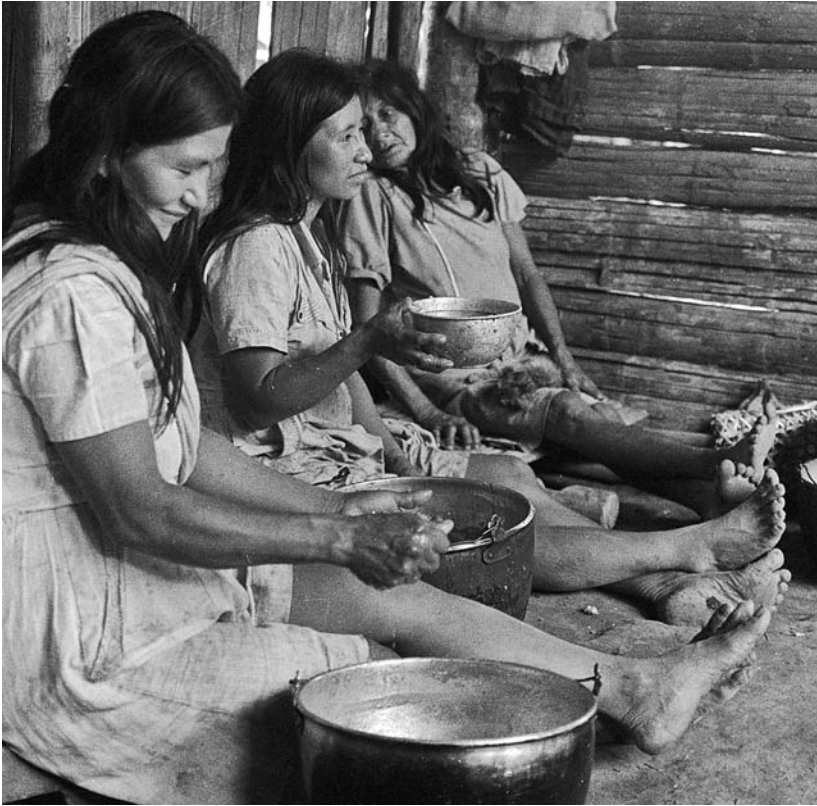
FIGURE 3. Drinking beer.

with Runa hunters, others when I was left alone in the forest, sometimes for hours, as these hunters ran off in pursuit of their quarry—quarry that sometimes ended up circling back on me. Still others occurred during my slow strolls at dusk in the forest just beyond the manioc gardens that surround people’s houses where I would be privy to the last burst of activity before so many of the forest’s creatures settled down for the night.